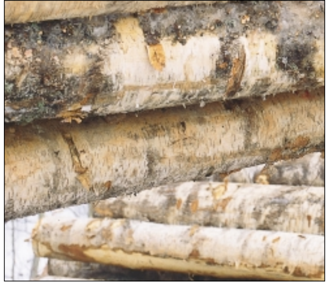
The construction of the jaws enables the grapple to dig into the pile and picking up the timber is easier.