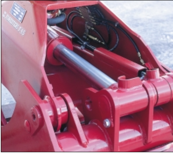
The grapples F38 and F45 can be fitted with an optional central lubrication system.